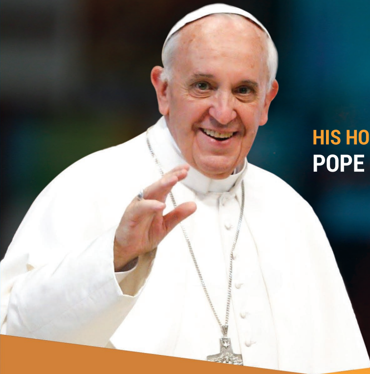
HIS HOLINESS POPE FRANCIS